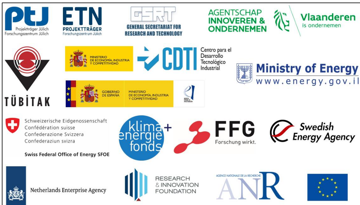
Figure 1: Organisations involved in promoting the SOLAR-ERA.NET Cofund 2 Additional Joint Call and providing support and funding to innovative transnational projects.

The participating national SOLAR-ERA.NET partners / contact points are listed in Table 1. Applicants are strongly encouraged to check the project idea and specific requirements with the national / regional contact point as early as possible in the preproposal phase.